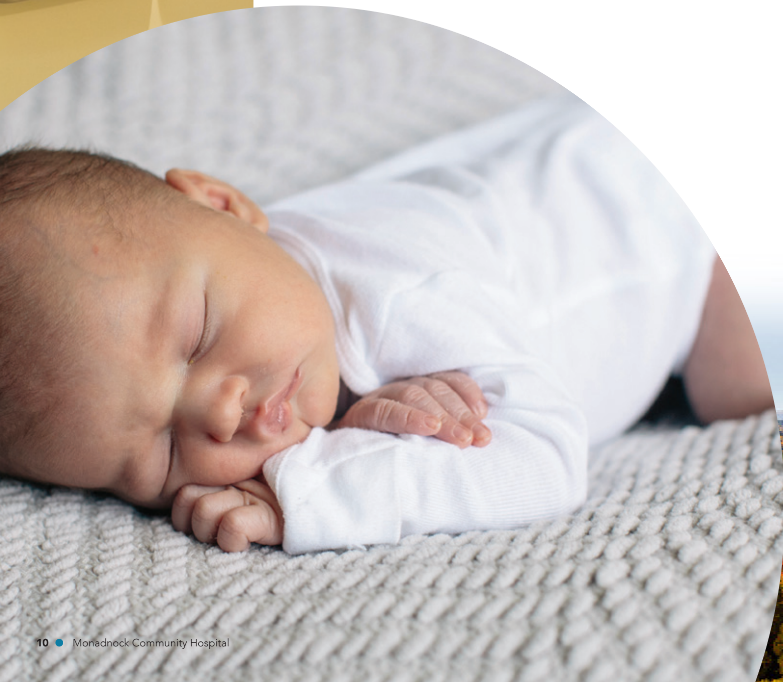
Trish Harper, RN

In 2016, we delivered 353 babies in our serene, family-centered space, where partners, siblings, and loved ones are always welcome and skin-to-skin bonding and breastfeeding are encouraged and supported. From completely natural childbirth to epidural anesthesia, we offer a full range of birthing options, so each family can safely experience the wonder of birth in their own special way.