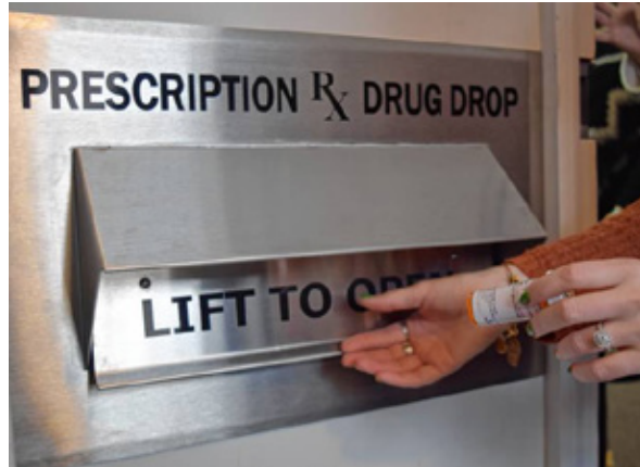
The new prescription drug take-back box located at the Peterborough Police Department

Due to the growing need for mental health and addiction support, MCH created Be the Change, a community-based task force which provides education and resources regarding substance use and mental health to our community. The task force consists of many community partners, such as the police and fire departments, schools and resource centers, parents, and people in recovery.