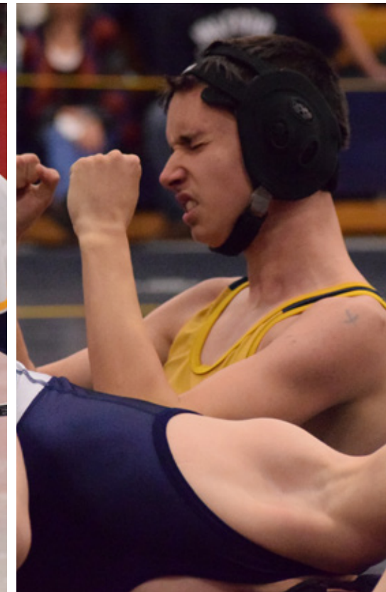
ConVal athletes in action